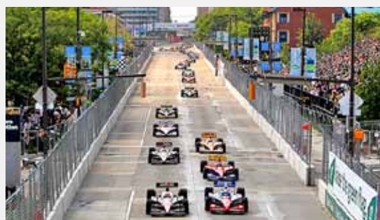
Grand Prix of Baltimore