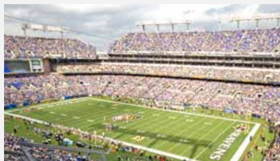
M&amp;T Bank Stadium | Baltimore Ravens