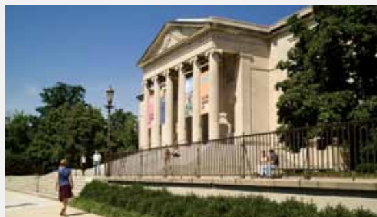
Baltimore Museum of Art

The Chesapeake Bay is the largest estuary in the United States. Largely known for its beauty and seafood production, the Bay is a main feature for tourists visiting the area who enjoy fishing, crabbing, sailing, boating, swimming, kayaking, and other water sports.