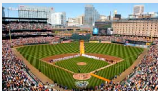
Oriole Park at Camden Yards | Baltimore Orioles