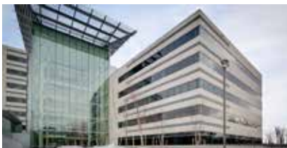
SOCIAL SECURITY ADMINISTRATION